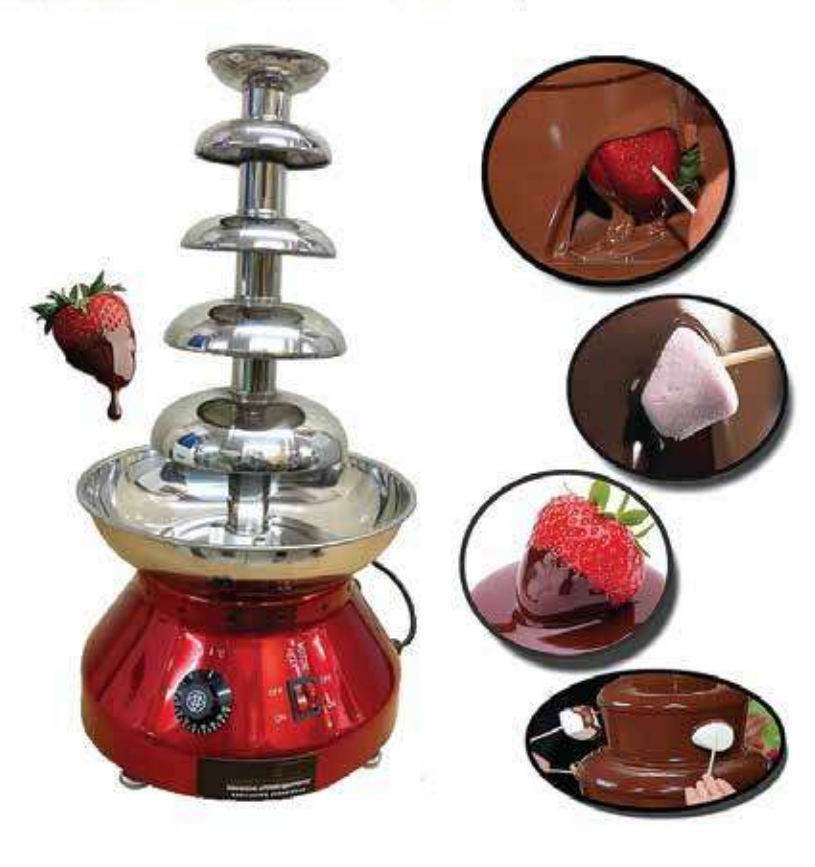
DX1X CHOCKLATE FOUNTAINS DINEX SEMI PROFESSIONAL